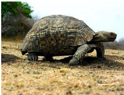
Leopard Tortoise: walking safari.

South Luangwa National Park is one of the world's great wildernesses and provides a great insight into Africa's rich fauna and flora. We have the option to do a walking safari today.