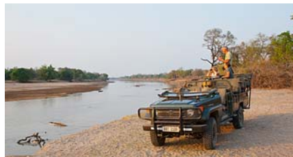
Game drive in South Luangwa

endemic species such as Thornicroft's giraffe and Cookson's wildebeest.