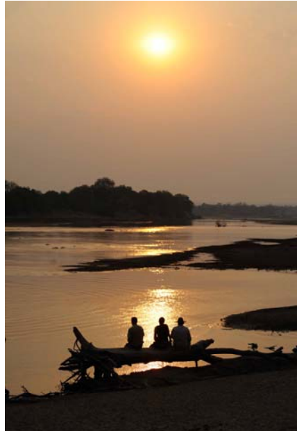
Sun downer at the Luangwa River