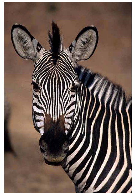
Zebra, South Luangwa NP