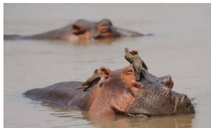
Hippo - South Luangwa NP