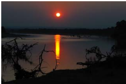
Sunset over the Luangwa River

The Luangwa valley is one of Africa's prime wildlife sanctuaries, with concentrations and varieties of game and birdlife that have made it world famous. This is the landscape of the 'real Africa', with herds of antelope roaming the plains, predators stalking through the shadows, and primordial flora in every vale.