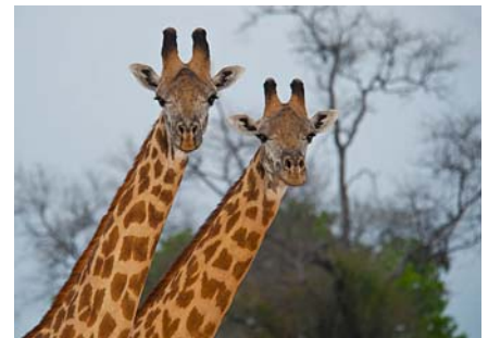
Thornicroft's Giraffe, South Luangwa NP