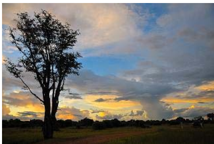
Sunset in Luangwa.

The afternoon rolls into our afternoon/night game drive. This is followed by dinner and our last night next to the crackling camp fire.